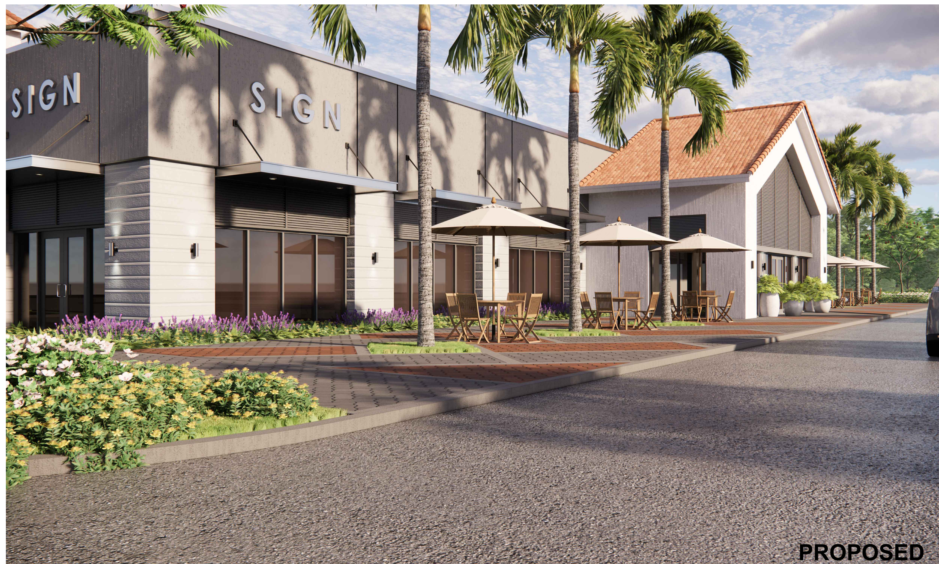
EXISTING BUILDING NORTHEAST PROPOSED VIEW (REFERENCE ONLY)