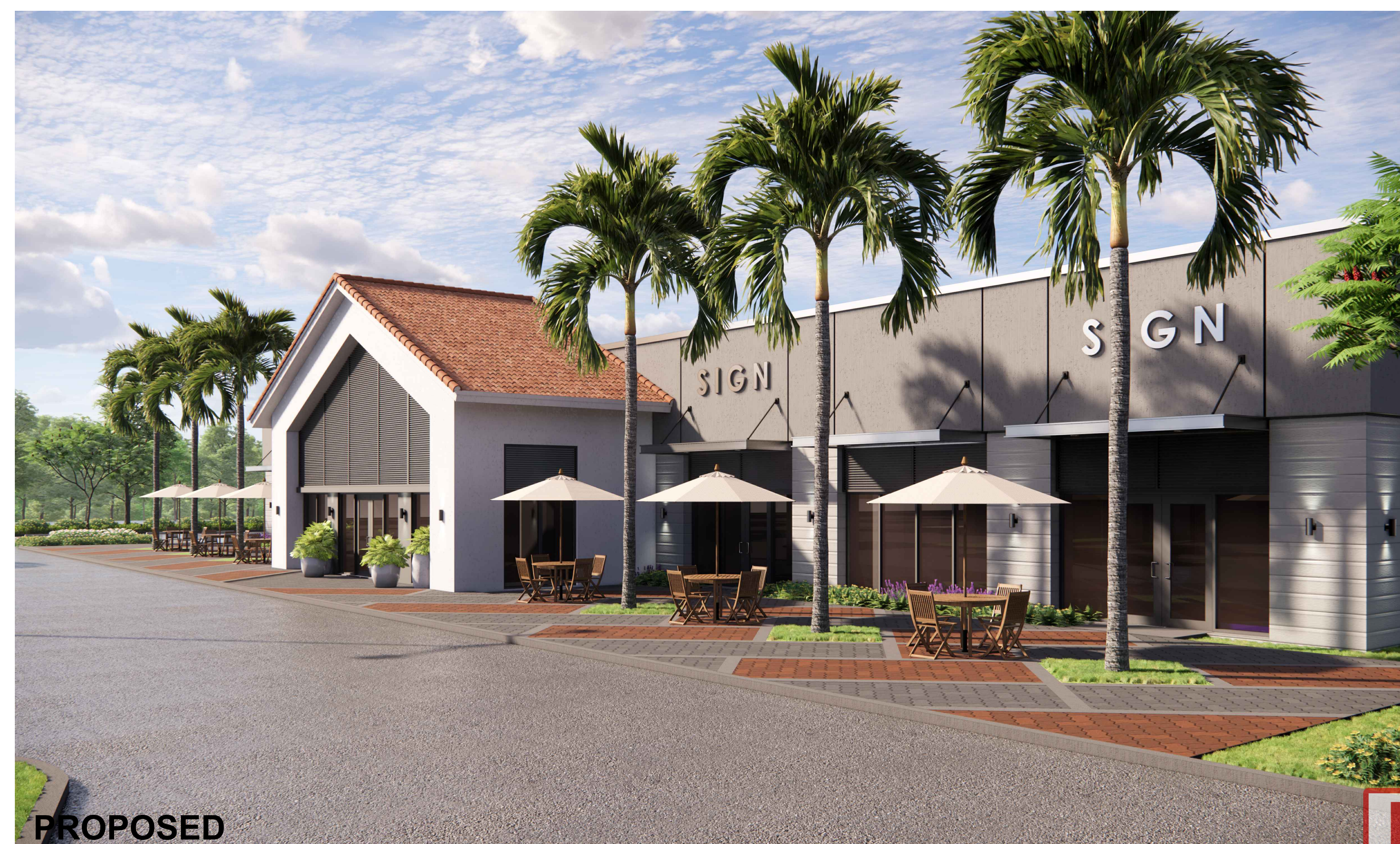
EXISTING BUILDING SOUTHEAST PROPOSED VIEW (REFERENCE ONLY)